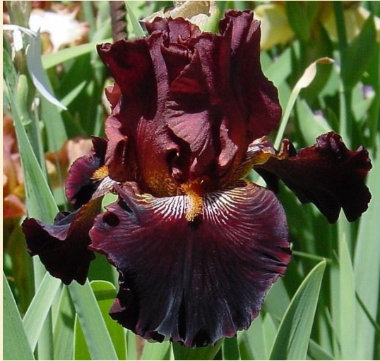
Dark Velvet Falls Seedling