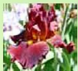
'My Little Wagon' TB 33-34"