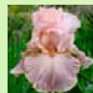
'Naturally Sweet' TB 35-36"