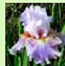
'Prismatic Crown' TB 34-35"