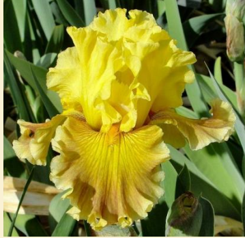
Seedling Sly Fox Cross