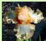
'Pamela Rae' TB 31"