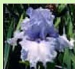
'Blue Coyote' TB 34-35"

2012 introductions by Margie Valenzuela available from Nola's Iris Garden: